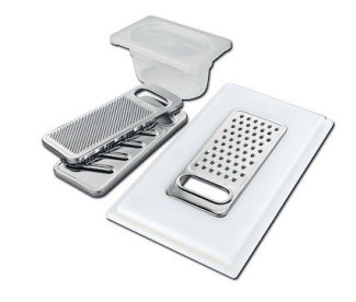
Grating kit complete with ring support and food collection tray 8159 101