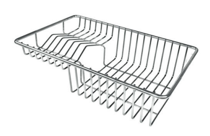
Stainless Steel dishes holder 8100 303