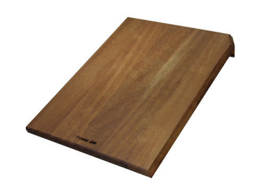
Chopping board 8656 001