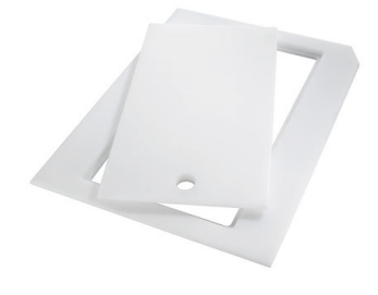
HDPE Twin Chopping Board 8644 100