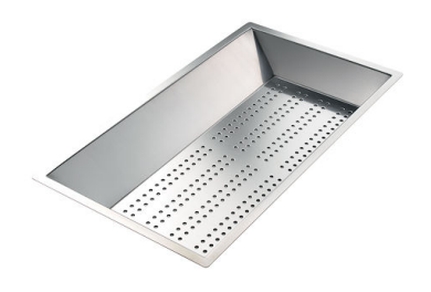
Stainless steel perforated pan 8151 000